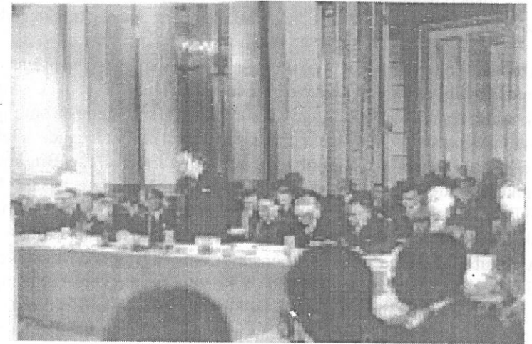
Uganda Constitutional Conference

Wano kisaana kimanyibwe nti newakubadde nga Kabaka Muteesa yagendanga wamu n'ababaka ba Buganda e Bungereza mu kuteesa n'Omukulu w'amatwale, naye ye kennyini teyeetabanga mu kuteesa okwo. Katikkiro Kintu ye yakulemberanga Ababaka ba Buganda ne bamala okuteesa n'Omukulu w'Amatwale eyabangawo mu kiseera ekyo