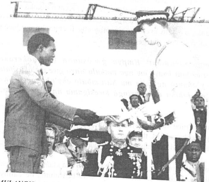
OMULANGIRA DUKE OF KENT NG'AKWASA MILTON OBOTE OBUYINZA OBUKKIRIZA UGANDA OKWEFUGA

by'Ameefuga nga mwe muli Konsityusoni ya Uganda Eyeefuga (Constitutional Instruments) n'abikwasa Prime Minister Apolo Milton Obote. Nga kano ke kaseera kennyini mu mateeka “British Protectorate” we yakoma, ate Uganda Eyeefuga n'etandika. Duke of Kent ng'amaze eby'okukwasa ebiwandiiko, Prime Minister Milton Obote yasituka n'amwebaza era n'amutegeeza nga Uganda bw'esanyuse ennyo okugiwa obwetwaaze bwayo era nga yeesunga ennyo Uganda okutwala ekifo kyayo mu bujuvu mu kibiina kya Commonwealth era ng'ekyo bwe kijja okugizzaamu ennyo amaanyi. Mu kiseera ekyo eky'ameefuga era n'omukulu w'Amatwale ow'e Bungereza Mr. Duncan Sandys naye yaweereza obubaka obuyozaayoza Uganda okutuuka ku kwefuga.