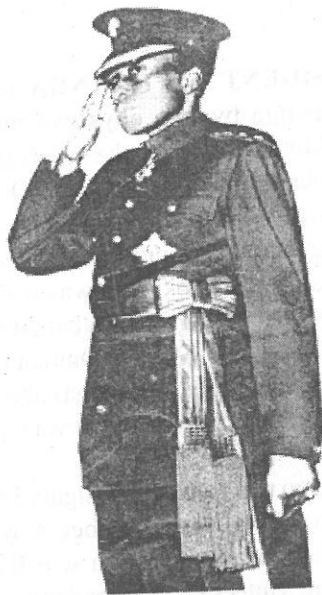
Sir Edward Muteesa II president wa Uganda era Commander-in-Chief w'Amagye ga Uganda yonna.

gy'ekifo ekyo kye muntaddemu ku lw'obungi bw'abantu bonna ab'ensi eno".